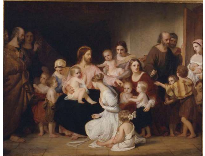
Christ Blessing Little Children, by Charles Lock Eastlake (1839)

Sunday Readings: Year B Weekday Readings: Year 2