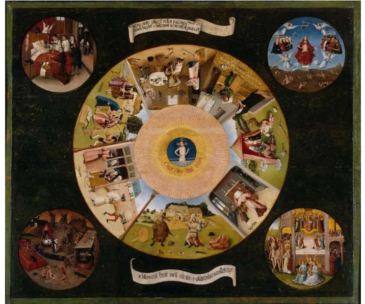
The Seven Deadly Sins and the Four Last Things by Hieronymus Bosch (disputed) c. 1500

Today's gospel asks us to see where the corrosiveness of sin eats away at our discipleship of Christ: the fault lines in our lives of faith. Not just the sins that come to mind so easily, but the more subtle workings of Satan: the presumption that we are better than other people; our exclusion of others simply because they are different from ourselves. If we really open ourselves to Jesus Christ we will experience the transforming power of his love. If we really say – and pray – 'God, help me in my weakness, pull me up from the mire of my own foolishness and stand me on my feet again' – God will do it. We have, in the Sacrament of Reconciliation, the absolute reality of the forgiveness of God and we receive the strength of the Holy Spirit to renew our lives of faith.