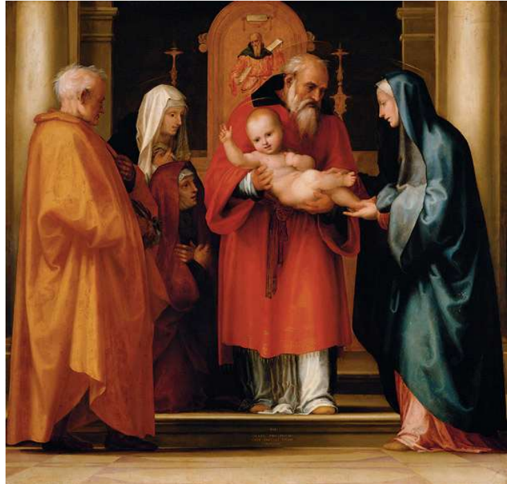
Presentation of Jesus at the Temple , Fra Bartolomeo (1472–1517)

The Feast of the Presentation of the Lord, or Candlemas, goes back at least to the fourth century. It has always been understood as the showing of Christ as the 'light of the nations'. St Luke expresses with extraordinary beauty that, through the witness of the aging Simeon and Anna, the Christ child is the fulfilment of the ancient prophecy of Malachi. It is Jesus whom the people of Israel seek, the Messiah who will suddenly enter his temple.